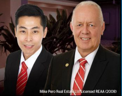
Mike Pero Real Estate Ltd Licensed REAA (2008)